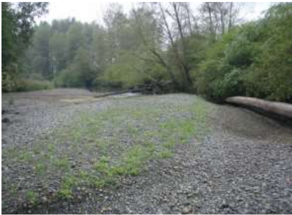
View of the Cowichan River North Fork on July 20, 2012 at a flow of 13.5 cms at the Duncan WSC gauge illustrating how aggradation is limiting fish passage through the North Fork. (BCCF 2013).

The accelerated bedload delivery of coarse sediments to the lower Cowichan River reduces channel width and increases channel width. The lack of channel depth when combined with low summer flows can limit upstream