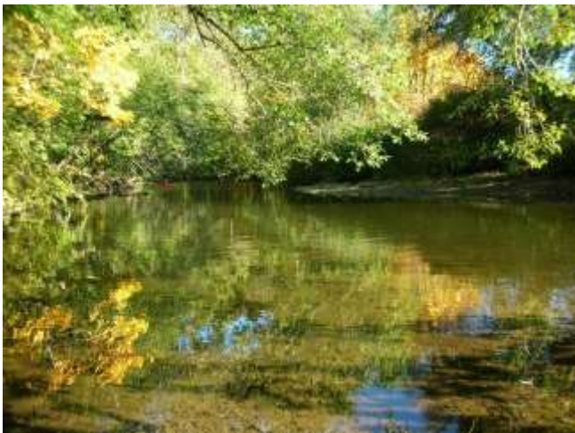
Downstream view of the lower Koksilah River illustrating extensive shallow habitat lacking sufficient deep pool cover and complexity for migrating spawners (fall 2009).

The lower mainstem habitat offers only marginal quality holding habitat due to aggraded shallow reaches, lack of instream cover and complexity as well as a low frequency of functional LWD and deep holding pools through the lower floodplain reaches of the Koksilah and Cowichan Rivers. The lack of cover and extended shallow sections leave the spawners exposed and vulnerable to predation and interception. Higher habitat complexity throughout the mainstem Cowichan and Koksilah Rivers would also increase rearing habitat quality.