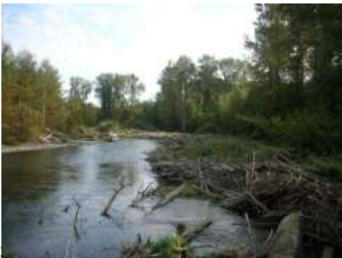
Downstream view of the mainstem Cowichan river at the intake to Major Jimmy's sidechannel illustrating the large accumulation of woody debris along the right bank and the resulting lack of natural channel bank characteristics (2009).

The channelized mainstem reach immediately downstream of the Highway 1 bridge is characterized by homogenous and deep, extensive glide/riffle zone that illustrates the loss of a natural pool/riffle ratios, loss of channel bank features, natural frequency of LWD and Native riparian habitat that was present prior to construction of flood protection dikes. The loss of vertical and lateral complexity reduces the frequency of protected alcoves, undercut banks, accumulation of stable large woody debris as well as stable substrates. Instead, there are sections in the lower river where there are large accumulations of small woody debris that have altered natural shoreline features. As well, there has been an alteration of natural instream cover (i.e. LWD, boulders, rooted aquatic plants) and the loss of instream features results in the reduction of invertebrate production, depth and frequency of lateral pools as well as the loss of refuge habitat for juvenile salmonids. These habitat features can be the most significant factor affecting fish production in channelized streams (Tarplee 1971 in Lill et al.1975).