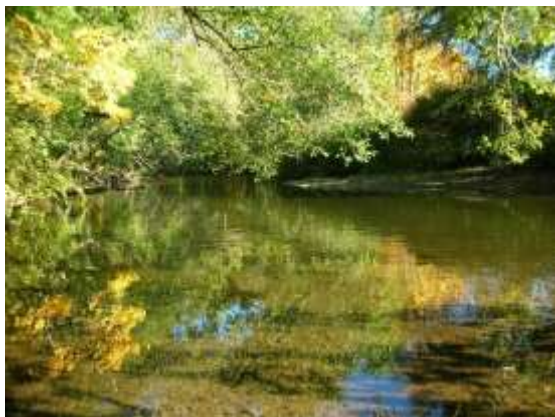
Downstream view of the lower Koksilah River illustrating extensive shallow habitat that can be observed throughout the lower floodplain reach that is lacking sufficient deep pool cover and complexity for migrating spawners (fall 2009).

The lower mainstem habitat offers only marginal quality holding habitat due to aggraded shallow reaches, lack of instream cover and complexity as well as a low frequency of functional LWD and deep holding pools through the lower floodplain reaches of the Koksilah and Cowichan Rivers. The lack of cover and extended shallow sections leave the spawners exposed and vulnerable to predation and interception. Higher habitat complexity throughout the mainstem Cowichan and Koksilah Rivers would also increase rearing habitat quality.