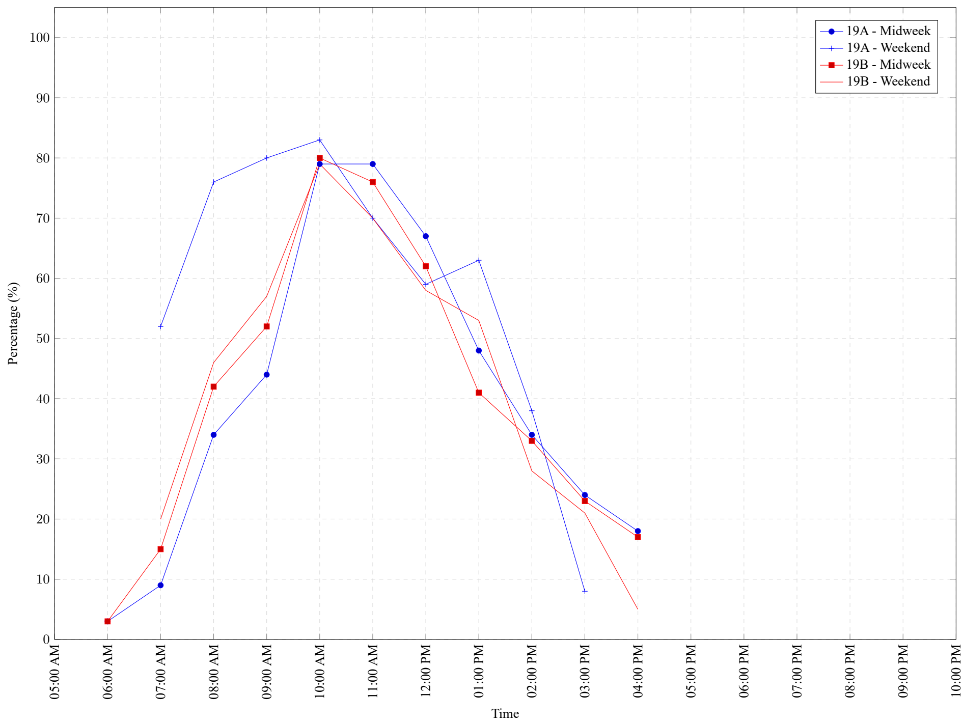
Figure 1: Proportion of each day's fishing by hour.